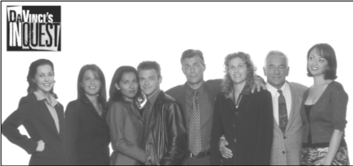
Da Vinci's Inquest

Group 1 list after 10 years on the Group 2 and 3 lists). The producer is first entitled to name request workers from the Group 1 list and may only request workers from the Group 2 list when 2% or fewer of the persons on the Group 1 list are available for work. Similarly, the producer may only request workers from the Group 3 list when 2% or fewer of the persons on each of the Group 1 and Group 2 lists are available for work.